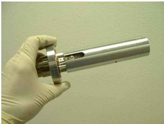
Figure 1. Electron multiplier with cover

The multiplier has an aluminum cover (Figure 2) that can slide down and short out the collector housing. When this happens, the signal to noise ratio is reduced by a factor of three. Fortunately, this is an easy problem to diagnose and fix.