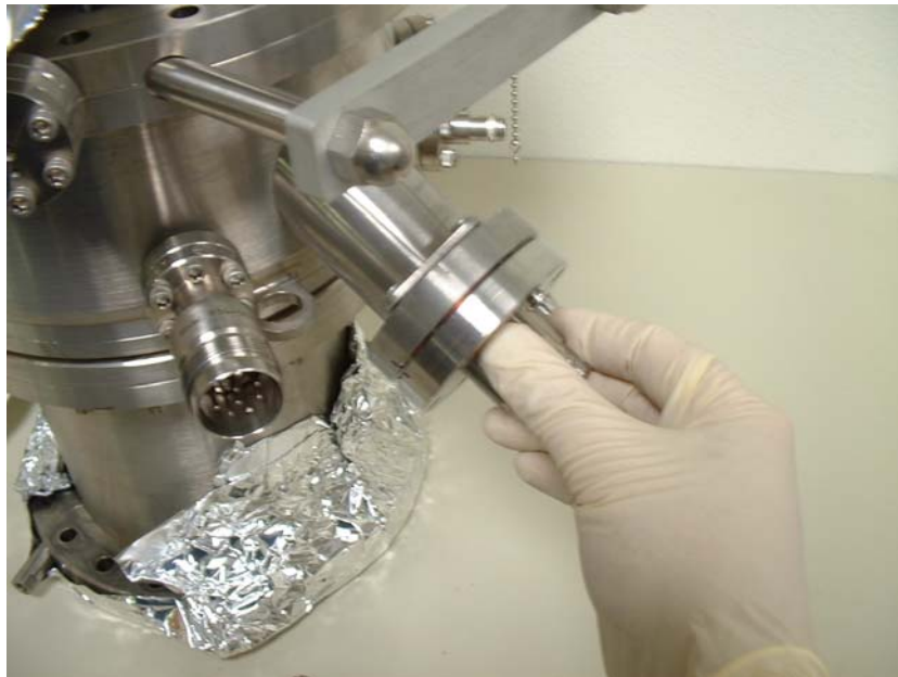
Figure 3. Reinstalling the multiplier into the CMA